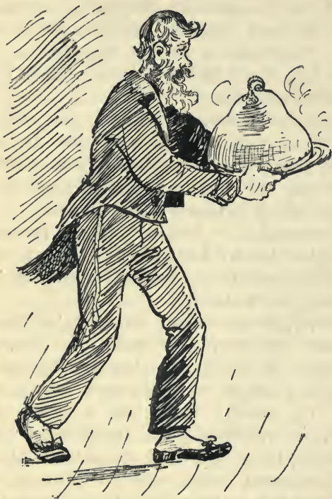
THE MEAL WAS HURLED ON TO THE TABLE BY CRUSOE

before the matter was settled. A brief glance at my attendant's hands decided me to let the woolly